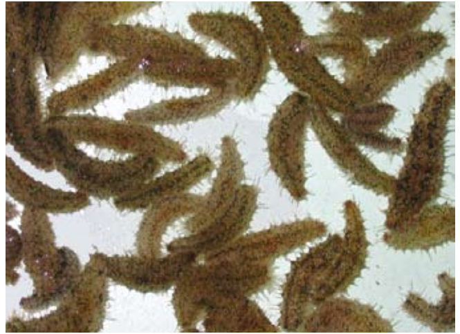
Juveniles spend about two months in the nursery phase.

sea ranching to rebuild depleted natural stocks.